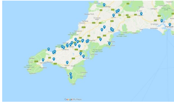
Figure 4: Locations of schools and institutions that have interacted with UDDGP.