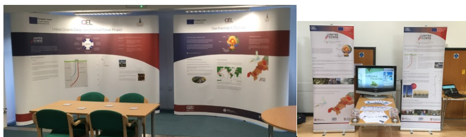
Figure 6: Exhibition panels used for public events away from the site

At project-specific exhibitions, public meetings, community events and shows it is not practical to make presentations of the kind described above. For those events GEL prepared large and small exhibition panels (Figure 6). The large panels were generally used for indoor events in large venues while the small panels, together with a TV screen for displaying project films, were used as an information booth in small venues and outside. The content and design principles adopted for these panels were the same as for the information panels at the site. To date, the panels have been used at around 30 public events reaching approximately 1000 people.