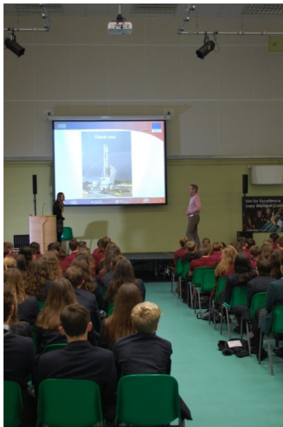
Figure 2: Raspberry Shake Seismic Hub at Richard Lander School, Cornwall.

The Raspberry Shake Programme was launched at the end of November 2018. Three 'Hub Sessions' were held at secondary schools closest to the project site, reaching approximately 550 Year 10 geography students. Each Hub Session comprised a presentation from UDDGP staff, a viewing of the KS3 animation and a Q&A session.