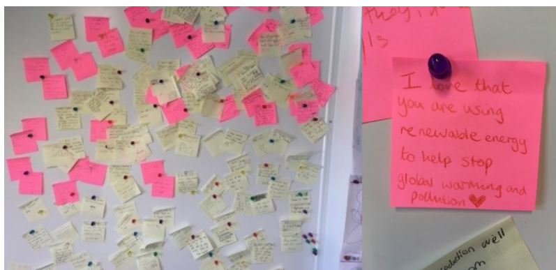
Figure 3: Notes left by younger students visiting the site.

School-age children and students are far more aware of the effect that climate change is having on the world and are supportive of a new technology in the UK that will reduce carbon emissions within the energy industry. At the end of site visits, young students are asked to write one thing that they have learned or like about geothermal energy or the UDDGP project. These are a good indicator of how the intended messages from the education programme are received.