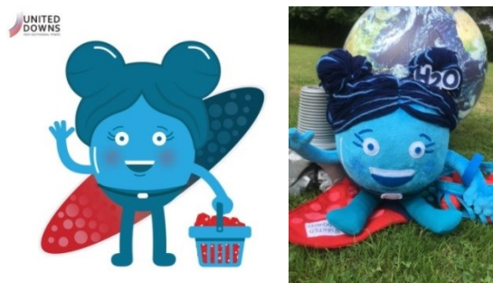
Figure 1: 'Miss Molecule' – The main character from the KS2 animation that helped GEL to teach the concept of water flow at United Downs

GEL commissioned the production of two animation videos; one for ages 7–11, the other for ages 11+. The team worked closely with a local animation studio to tell the story of geothermal energy and how it relates to current global issues such as climate change. The mechanics of how a geothermal energy system works were explained in both animations, with the video for younger children featuring a character called "Miss Molecule" who transports the heat energy from the reservoir to the power plant to produce electricity.