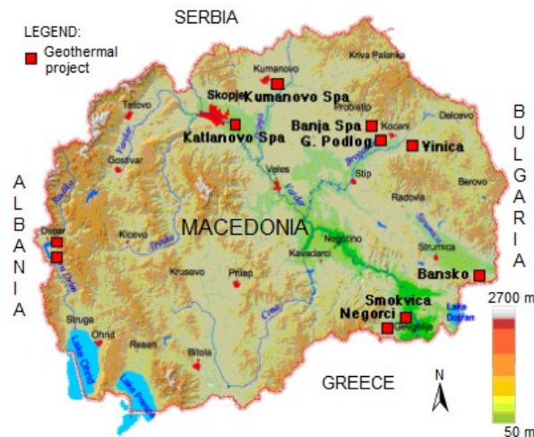
Figure 3: Location of geothermal projects in Macedonia

There are two geothermal fields in the Skopje valley: Volkovo and Katlanovo spa. There is no hydraulic connection between them. The main characteristics of the Skopje hydro-geothermal system are: maximum measured temperature of 54.4°C and predicted reservoir temperature (by chemical geothermometers) of 80-115°C (Gorgieva, 1989); the primary reservoir is composed of Precambrian and Paleozoic marbles; large masses of travertine deposited during the Pliocene and Quaternary period along the valley margins. There are only five boreholes with depths of 86 m in Katlanovo spa, 186 and 350 m in Volkovo and 1,654 and 2,000 m in the middle part of the valley. The last two boreholes are without geothermal anomaly and thermal waters because of their locations in Tertiary sediments with thickness up to 3,800 m. (Gorgieva, 2002)