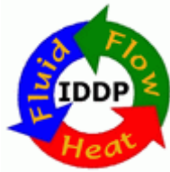
Figure 1: The IDDP logo shows the essential parameters behind the concept of thermal mining. The improvement of this basic idea by the IDDP is to drill deep enough into the roots of a conventional high temperature hydrothermal system to produce water at supercritical conditions and bring it to the surface as 400-600°C superheated steam, at subcritical pressures (<220 bar). In the case of low permeability systems, by injecting cold fluid into the hot rocks fractures can be induced to complete the thermal mining cycle

At the start-up meeting, it was emphasized that the IDDP would offer the scientific community unique opportunities to (a) study and sample fluids at supercritical conditions, and (b) to investigate the magmatic and fluid circulation of the Mid-Atlantic Ridge on land, environments of high-temperature geothermal systems that have never before been available for direct observation. The Drilling Panel evaluated five different strategies for achieving these goals. The consensus was that the most preferable option was to drill a “standard” production-type well to 3.5 km deep well and then continuously core a slim hole 1-1.5 km deeper using a hybrid-rotary coring technology. The GeoScience Panel developed criteria for selecting the sites that would be drilled from both geoscientific and environmental perspectives. Three geothermal fields, Reykjanes, Hengill and Krafla, were selected as best fitting the criteria of being well enough studied to ensure a high probability of encountering a permeable supercritical reservoir at drillable depth (see Figure 2).