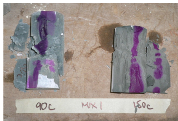
Figure 1: Slag based control mix after only 6 days showing loss of alkalinity

The cylinders removed were cracked and showed heavy carbonation which was evident from the significant loss of alkalinity according to the phenolphthalein test. In Fig 1, unstained areas have a pH of 10 or less. The carbonation was less in the interior, but the exposure time was very short. Corrosion of the autoclave walls was observed due to sulphide attack from the slag atmosphere.