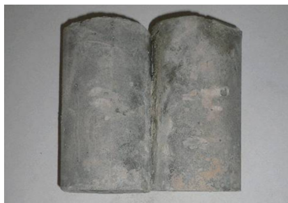
Figure 2: Two cylinders (mix 9) welded together with high density calcite after autoclave curing, demonstrating healing of cracks and voids

Addition of hydrated lime to the mixes further improves performance through the deposition of (expansive) calcite. The addition of hydrated lime to the mix provides a 'sink' for the CO_2 in the geothermal ground water. By providing an excess of hydrated lime the grout can form an expansive calcite phase which further helps to block up cracks and fractures and will help with bond to the steel casing. Addition of hydrated lime also helps the grout body provide passivity to the steel casing. Without the addition of lime there is a much more rapid carbonation of the calcium aluminate phases with accompanied shrinkage