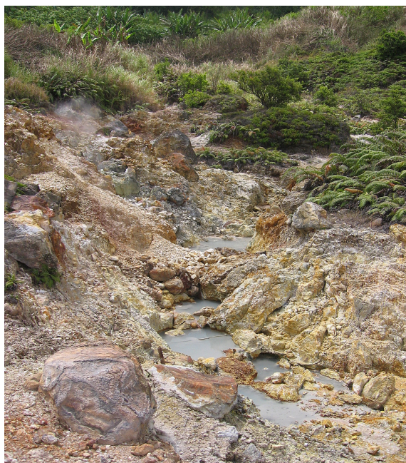
Figure 4: View of the active Mutubusa steaming ground area in the Sokoria prospect area (SW sector of Keli Mutu volcano).

The Mutubusa prospect appears to be one of the many 'daughter' systems fed by radial outflows from a large volcanic 'parent' system beneath the Keli Mutu volcanic complex. The various 'daughter' systems discharge dilute condensates, acid condensates, and mixed magmatic fluids. Their zonation and fluid chemistry have been described by Harvey et al. (1998, 2000). Significant active surface manifestations (some at boiling temperature) occur in steep and rugged terrain at c. 1,100 m elevation at the Mutubusa locality where minor, active fumaroles, minor mud pools, and steaming ground occur over an area of c. 1,500 m 2 (see Figure 4). The natural heat output appears to be of the order of 3 to 10 MW. Minor acid condensates (see Table 1) have produced acid alteration products. Diluted condensates occur in warm thermal springs further downstream but allow no estimate of fluid equilibrium conditions. The composition of gases discharged at Mutubusa (CH 4 -CO 2 ) point to deep gas equilibrium temperatures of c. 300 deg C (Harvey et al., 2000). The Mutubusa prospect is also called the 'Sokoria' prospect after discharges at c. 800 m elevation near the village of Sokoria, c. 2 km downstream from Mutubusa.