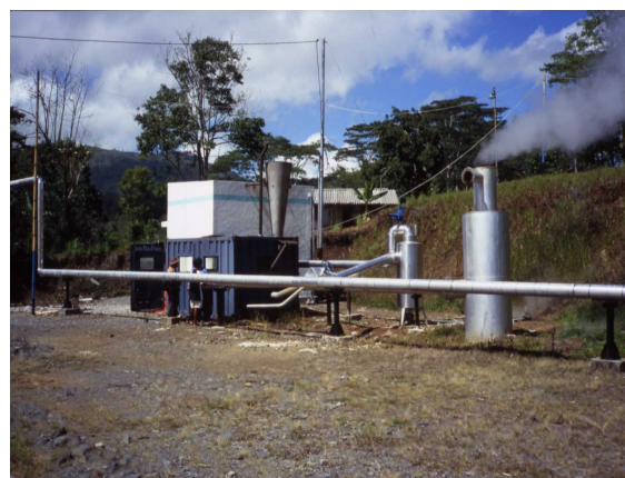
Figure 6: The Mataloko geothermal test plant using steam from MT-2 well to produce c. 0.1 MWe (under construction in October 2008)

wells (MT-3 and MT-5) were drilled from the same platform, about 100 m N of the pad with MT-01 and MT-2. MT-3 was drilled to 615 m depth (casing to 472 m) but produced only 3 t/hr of steam. MT-5 went down to 378 m, producing 18 t/hr. All yields were obtained when discharging at well head pressures of 5.5 to 6 bars. The last two wells were step-out wells. MT-4 became the deepest well reaching a depth of 756 m (casing to c.600 m). It was located c. 450 m from MT-2 and produced only 2 t/hr steam with bottom hole temperature of c. 205 deg C (Kasbani et al., 2004). The last step-out well was MT-6, drilled c. 200 m to the N of MT-2 to a depth of 180 m. It suffered a total loss at 150 m depth and will be used as injection well.