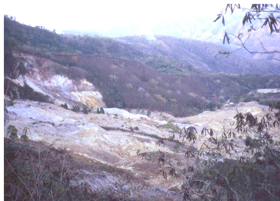
Figure 3: The Waitoba Landslide of 1980. It started from the thermally altered rocks exposed in the cliffs on the L hand side (the horizontal distance of the landslide material in the photo is about 1 km).

The inferred caldera in the centre of the prospect was further explored by drilling of two temperature gradient holes (250 m depth) in 2002 and two deeper exploratory holes (AT-1 and AT-2) in 2005. The latter could not be completed after some drilling failure. AT-1 was drilled to 830 m depth. Incomplete borehole measurements showed a maximum