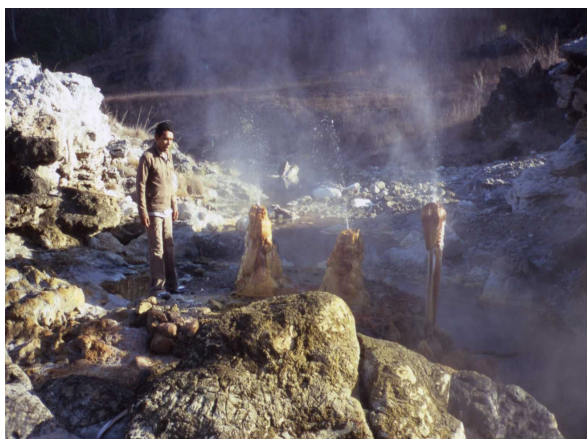
Figure 2: View of the spouting hot springs (spouters) at Bukapeting.

The hydrological setting and manifestations at Bukapeting have an affinity with those at Cisolok (Java) which have the characteristic features of an outflow of neutral pH, NaCl-type waters (Hochstein, 1988). The discharges at Bukapeting, however, are smaller. With reference to the data shown in Table 1, the ratio of the fast equilibrating K and Mg constituents points to equilibrium temperatures of c. 120 deg C upstream of the discharge area. The slow equilibration of the Na/K ratio points to deep (minimum) temperatures of c. 190 deg C near the parent source region. Bukapeting can, therefore, be classified as a high-T, liquid dominated system of unknown extent and hence unknown potential.