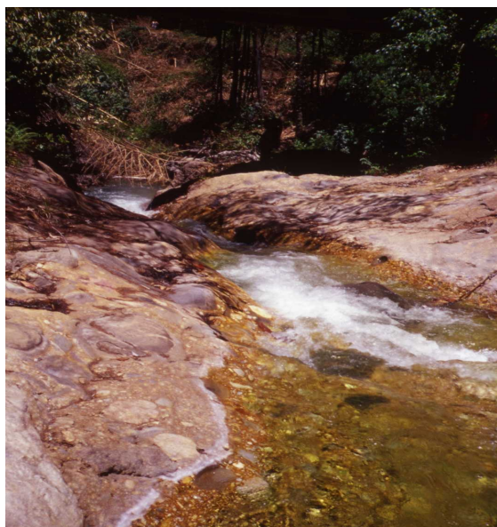
Figure 5: The Nage hot acid creek near the road bridge (T=56 deg C, pH=3, flow rate c. 400 kg/s on 22.10.2008).