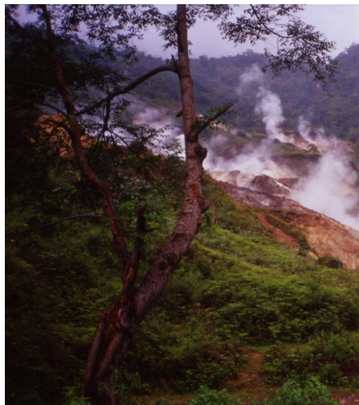
Figure 7: The Wai Kokor fumarole field (Ulumbu) with steaming ground elongated in NE direction. The field lies a few hundreds of meters upstream from the Ulumbu exploration wells.

geophysical surveys. Additional geophysical studies were carried out in 1989 as part of a small bilateral New Zealand