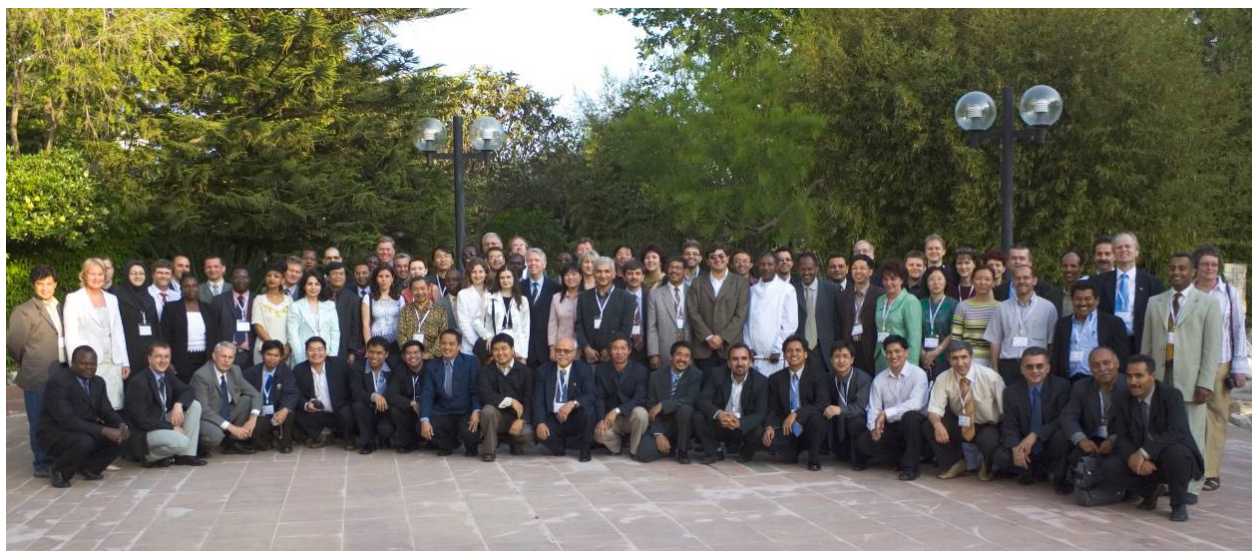
Figure 3: UNU Fellows with UNU-GTP staff and Studies Board at the WGC 2005 in Turkey; a third of the 318 UNU Fellows graduating 1979-2004 were authors of papers at the congress

The most memorable participation of UNU Fellows in the international arena was the World Geothermal Congress 2005 in Turkey (WGC 2005). The Congress is organized every five years by the IGA, this time with the Turkish Geothermal Association as a co-convenor. There were over 1300 participants from 80 countries. The UNU-GTP was very well represented. In all, 141 papers (20% of all papers) were authored or co-authored by 104 former UNU Fellows from 26 developing and transitional countries. The papers were divided between 23 of the 24 technical sessions of the conference. The level of activity of the UNU Fellows in the international geothermal community is well reflected in the fact that a third of the 318 graduates of the UNU-GTP from 1979-2004 were authors of refereed papers at the congress. The papers are accessible on www.unugtp.is .