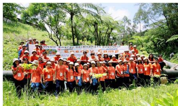
Figure 3: Selected high school students during the 2007 BGPF Annual Energy Youth Camp.

Aside from the establishment of the bat sanctuary and the implementation of the hunting ban, BGPF has also initially identified other possible components of its eco-tourism project. With the site's natural slopes and mounds ideal for hiking/trekking, rappelling and other outdoor sports, a one-hectare campsite complete with accessories and amenities has already been established in the area. For three (3) years now, BGPF has been hosting an annual Energy Camp, a two-week, youth-oriented summer activity for selected high school students that focuses on environmental protection and conservation (Figure 3).