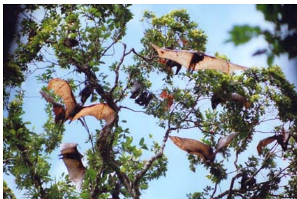
Figure 2: The golden-crowned flying fox, Acerodon jubatus , roosting along the BGPF Botong Twin Falls area.

The essential habitat of the golden-crowned flying fox includes the primary and secondary lowland forests reaching an elevation of up to 1100 masl (meters above sea level). Each night, these large fruit bats fly 40 kilometers or more, feeding on ripe figs and other forest-dwelling fruit trees. Playing their role as natural pollinators, these bats are an integral part of the lowland forest ecosystem since the consumed fruit seeds travel quickly through their digestive tracts which, in turn, are defecated during flight (Massicot, 2005).