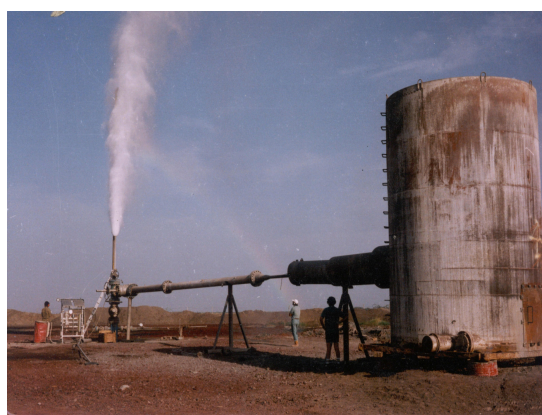
Figure 3: One of the shallow wells (TD-5) of the Tendaho Geothermal Field, Total Depth = 516 m; Maximum temperature = 253°C

Based on this and further studies, the Ministry of Mines and Energy is currently working on Tendaho for progressing it towards development. The recent upgrade of a trunk highway through the Tendaho area will help facilitate such exploration and development. In addition, the Ethiopian government plans to extend the country's main 230 kV transmission line to Semera, which is within ten km of the drilled wells at Dubti.