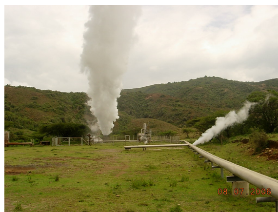
Figure 2: One of the Discharging wells (LA-3) of the Aluto-Langano Geothermal Field. Total Depth = 2.3 Km; Max. Temp = 320°C.

Two wells (LA3 and LA6) drilled on Aluto volcano produced 36 and 45 t.p.h. geothermal fluid at greater than 300°C along a fault zone oriented in the NNE-SSW direction. Two wells drilled as offsets to the west (LA4) and east (LA8) of this zone respectively produced 100 and 50 t.p.h. fluid with lower temperature. LA5, drilled in the far SE of the earlier two wells was abandoned at 1867m depth due to a fishing problem but however later showed a rise in temperature over an extended period of time. LA7 was drilled in the SW but could discharge only under stimulation, being subject to cold-water inflow at shallow depth. The earliest wells drilled in the prospect were drilled outside the present limits of the reservoir area, to the south (LA1) and west (LA2) of the area drilled later.