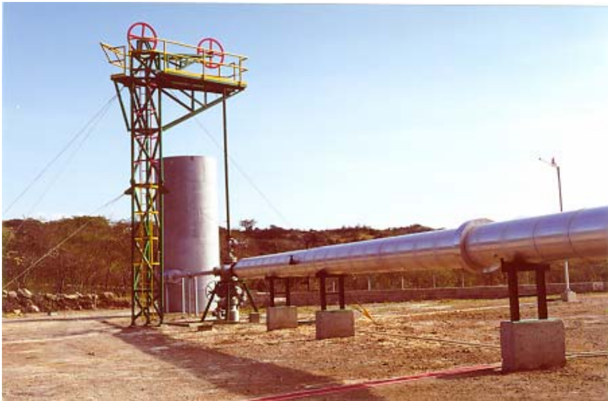
Figure 4: Inhibition System. Tower.