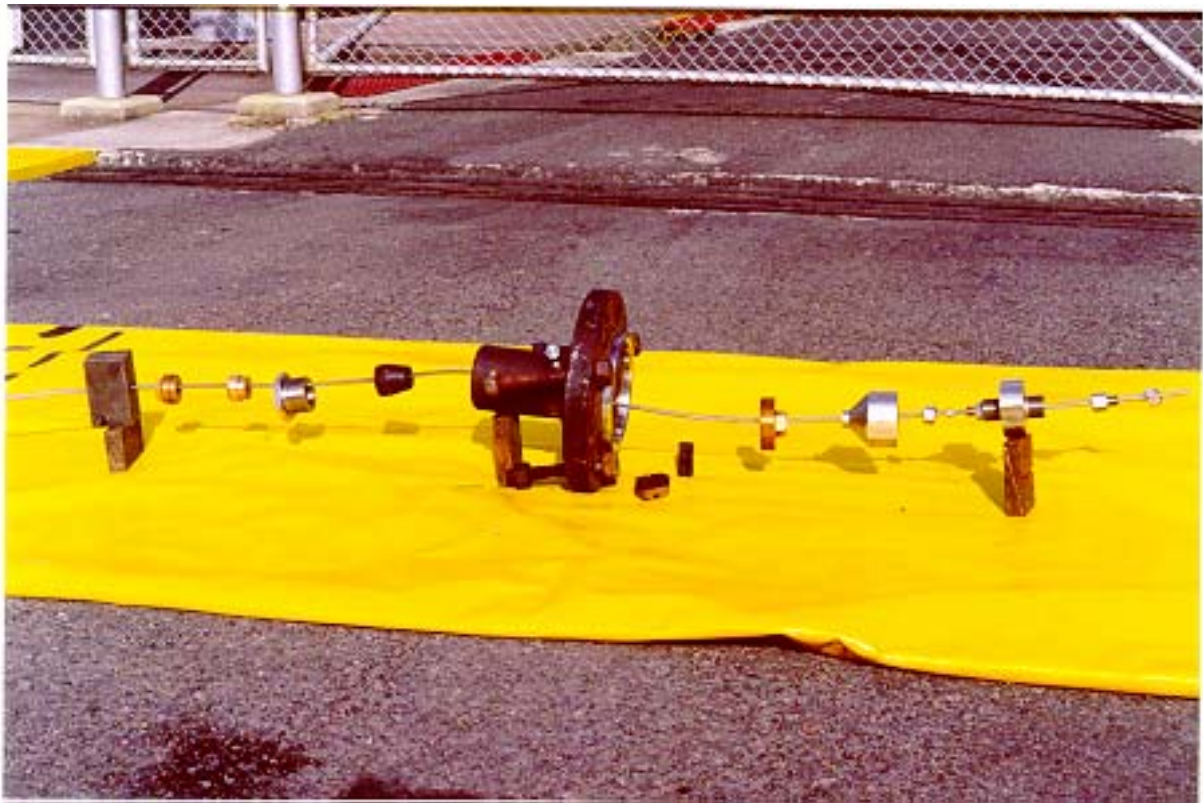
Figure 3: Inhibition System. Dispersion Head.