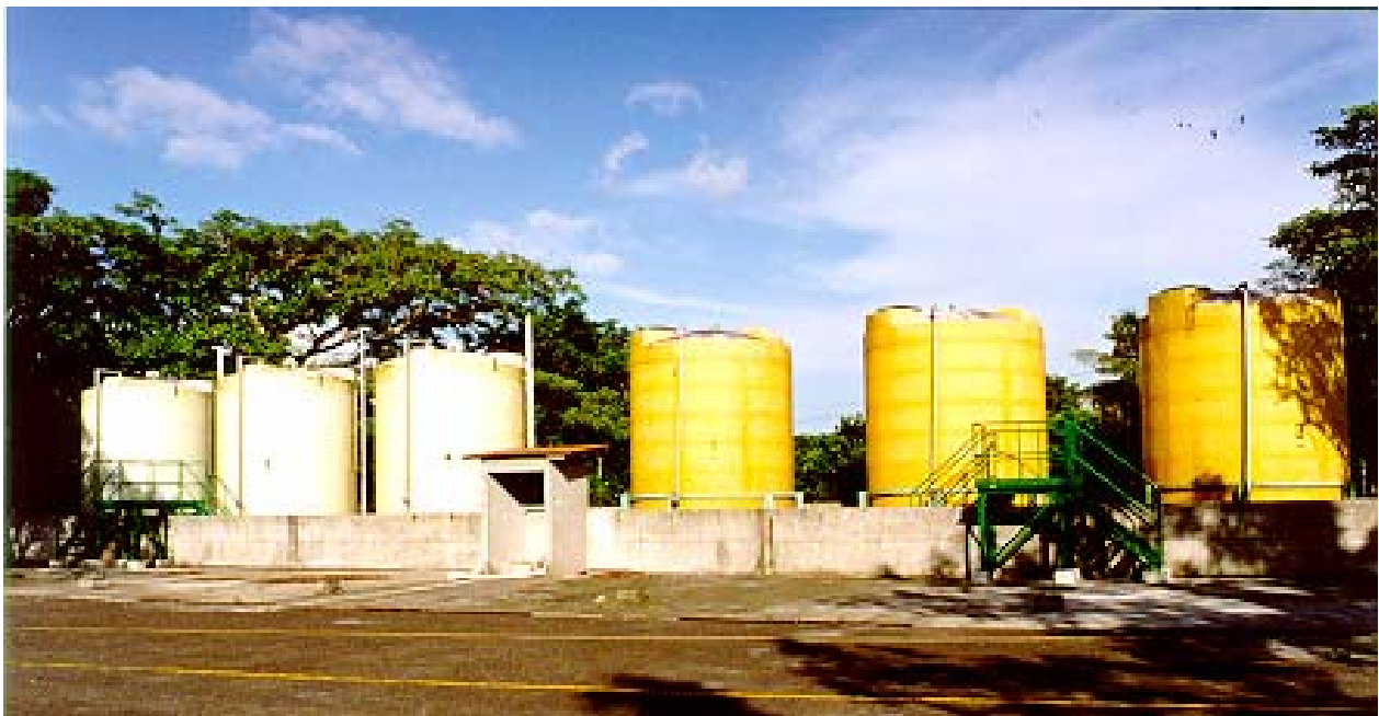
Figure 5: Inhibition System. Dilution Plant.