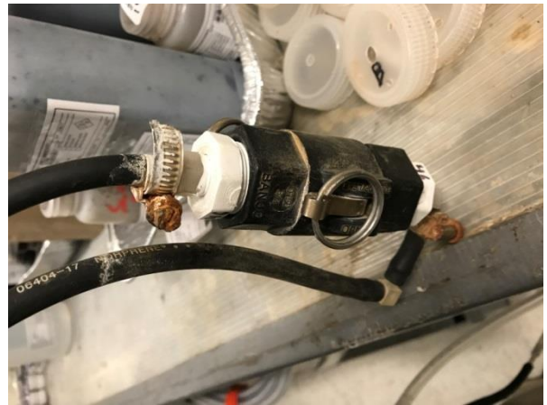
Figure 2: The recirculation-flow cell, which is placed vertically in the water bath, 60-80°C