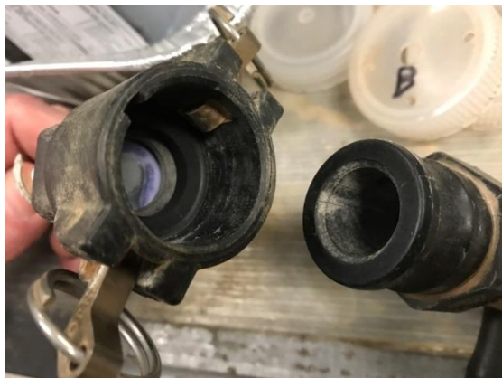
Figure 1: The inside of the cell where the deposit is placed at the bottom of the right side section

A flow through cell was designed to determine the dissolution of various deposits where the deposit was placed between the two finely perforated Teflon™ plugs enclosed in a high-density plastic cell shown in Figures 1 and 2. Pre weighed 2-3 grams of the deposit sample is placed in the bottom half of the cell, which is mounted vertically on to a holder and then the entire cell is immersed into a water bath. A circulating loop is made using a peristaltic pump and a small reservoir tank. The circulation loops mimics the online cleaning. The dissolution progress is monitored using the similar analysis as for the Jar test.