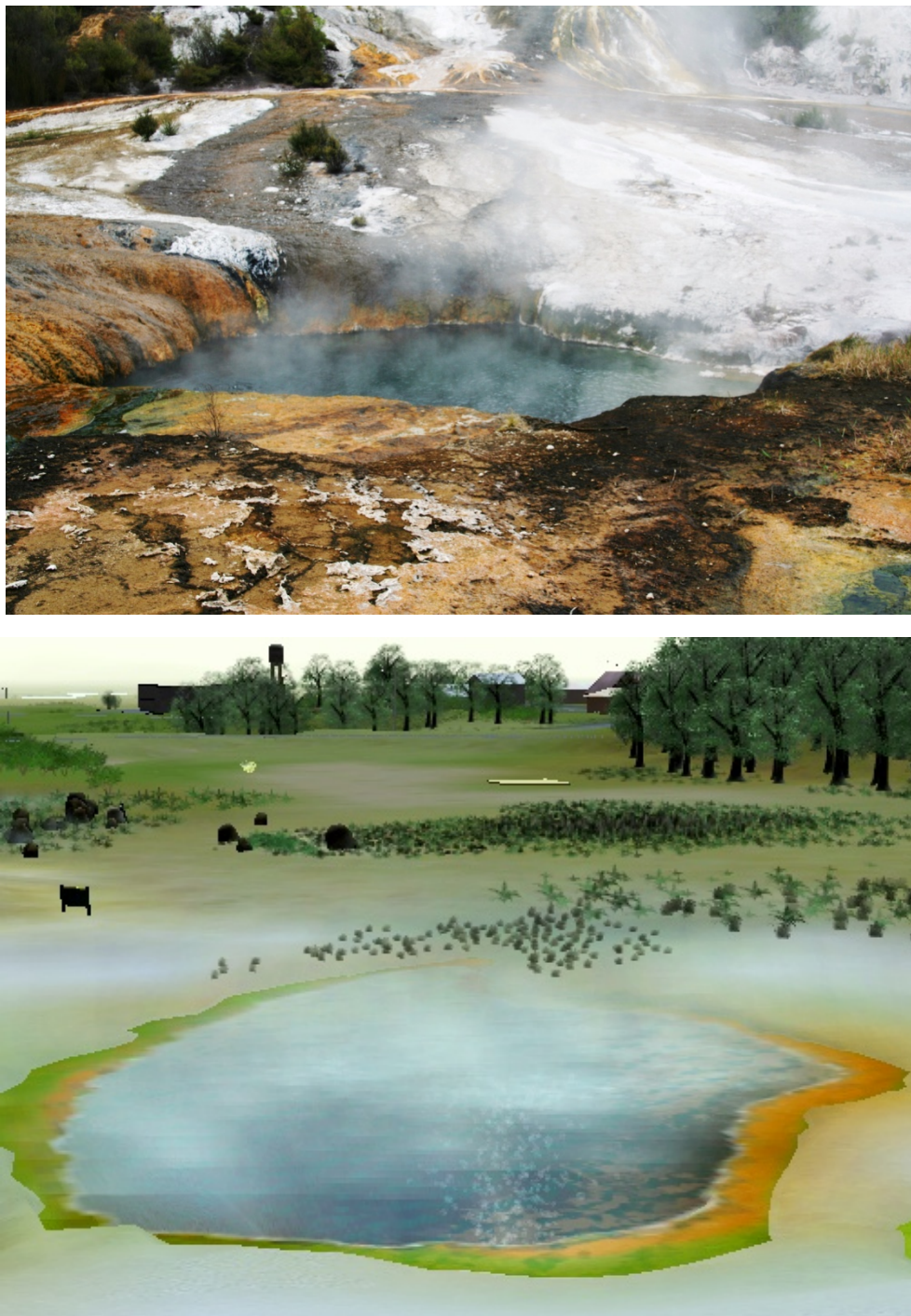
Figure 1: (Top) A photograph of the Hochstetter Pool (foreground) at Orakei Korako which the students were asked to describe in the field (Photo taken by Daniel Hill). (Bottom) A screenshot of one of the three, fictitious Sapphire Pools which were described by the students in the GeoThermal World videogame.

We discuss here the learning gains (i.e. knowledge acquired) achieved from a virtual field locality (the Sapphire Pools) within the videogame, compared to an actual field locality (the Hochstetter Pool) at Orakei Korako. Images of both settings are included in Figure 1.