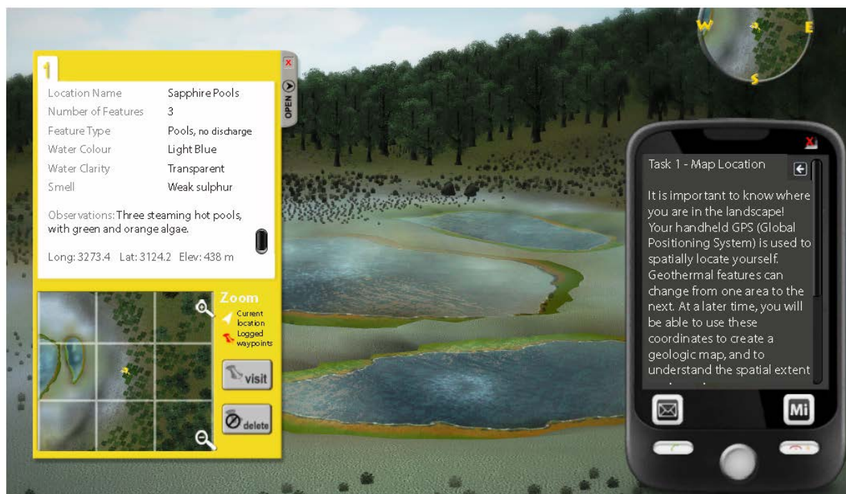
Figure 2: A screenshot of the Sapphire Pools, with two important tools which were developed for the videogame. (Left) A digital geologic notebook which has drop-down options (e.g. Number of features, etc.) and a section for written observations. (Right) The students' Smartphone, which contains hints and contextual information to guide the student through the observations of the hot pools.

The videogame study consisted of many 1-1.5 hour lab-style sessions where 1-6 students played individually and in pairs over several days in June 7 th , 8 th , and 12 th 2012. The computers were set-up adjacent to one another like a typical computer room/lab setting. Video observations were recorded to follow the behaviour, and student language use