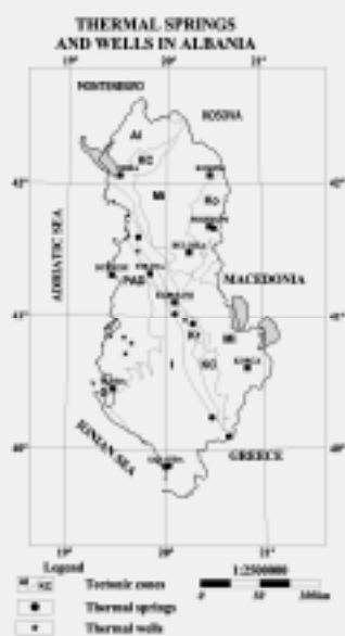
GEOHERMAL MAPS OF ALBANIA