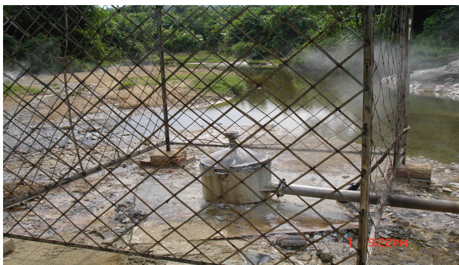
Photo 1: The geothermal water exploitation borehole location of Quang binh Coservo Company.

The hot water and gas have H 2 S sulfur gas, neutral pH. Total minerals degree gains 530mg/l, has been listed Na-HCO 3 . Total flow of hot water is measured about 50l/s. There is the borehole to reach up the depth 24 m. The temperature in the borehole is measured to reach up 105°C.