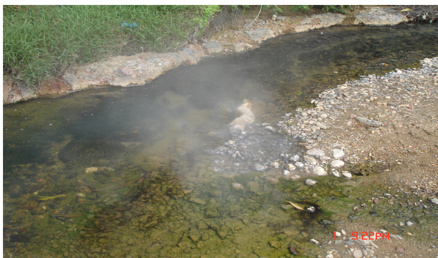
Photo 2: The location of geothermal water and gas discharge in the breccias zone in the stream line.